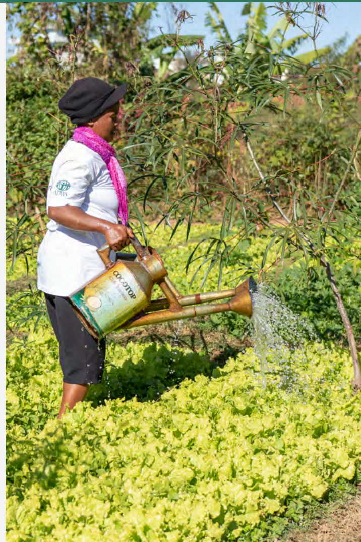
Figure 1: ADRA Madagascar's Well-Being Approach

ADRA Madagascar support people in need through an integrated approach that empowers communities to achieve sustainable well-being, reflecting God's love in every action. We implement a diverse portfolio of food security, health, education, and relief projects, primarily in the central, eastern, and southern regions of Madagascar (Figure 1). In the last five years, ADRA has impacted the lives of over one million people in Madagascar through 20 Disaster Relief and Emergency Projects with a budget of over 50million USD.